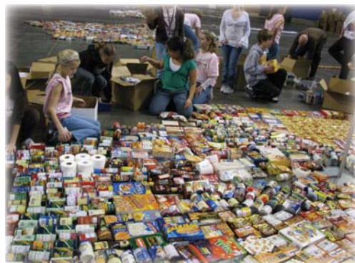
Students from Carl Ben Eielson Middle School fill the dome.