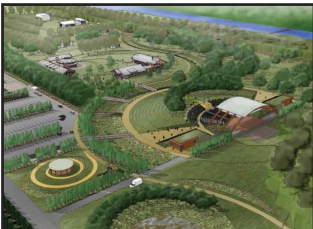
Architect rendering of the new Trollwood campus in Moorhead.