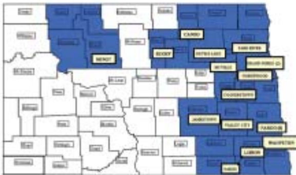
DCAP Service Area

Preliminary statistics reveal that the program is realizing its goals and objectives. Based on the first four months of data, the CRCs have recovered over $803,000 in Medicaid reimbursement (past medical bills and new enrollees) and have obtained $94,000 in prescription drugs for patients. Further, approximately 45% of patients referred to health coverage programs have been enrolled.