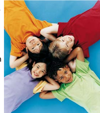
North Dakota is among the top five states nationwide reporting a large decline in the percentage of uninsured children

As the Initiative's initial funding from The Robert Wood Johnson Foundation expires in March 2007, DMF would like to recognize many individuals who dedicated their time and talent to this successful initiative. The substantial accomplishments of newly embedded eligibility and outreach system processes and long-term partnerships along with DMF's continued support will help us sustain outreach, simplification and coordination efforts well beyond the initial grant.