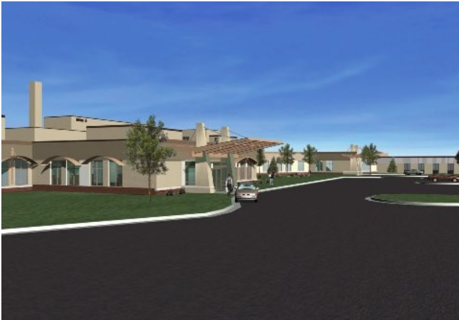
Simulated view of completed hospital

To better serve the 18,000 people within its primary service area and continue to deliver high quality healthcare services, RiverView Health recently completed a $19 million expansion and renovation project. The project created over 40,000 square feet of new space in RiverView Hospital and 15,000 square feet of new space in Hillcrest Nursing Home.