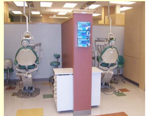
Pictured are two of the self-contained patient stations supported by DMF.

MSCTC is a member of the Minnesota State College and Universities System. The college serves more than 4,500 students in credit courses annually and provides a variety of education programs and delivery options at its four campuses located in Detroit Lakes, Fergus Falls, Moorhead, and Wadena.