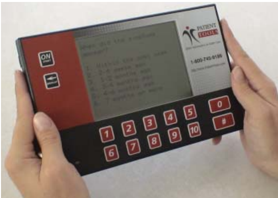
This picture displays the hand-held electronic device used for the screenings.

Caregivers bringing children, ages 0-5, to Innovis Health Pediatrics will have the opportunity to use a simple, hand-held electronic device to answer questions about their child's social-emotional development. The electronic screening tool provides immediate results for the pediatrician's review. If the results indicate concerns, the doctor and caregiver will discuss and decide whether or not to make a referral to the early childhood mental health professional for further assessment and consultation.